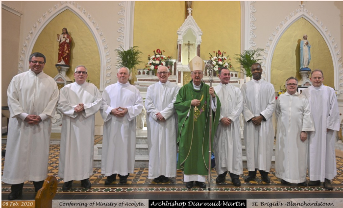
08 Feb. 2020 Conferring of Ministry of Acolyte Archbishop Diarmuid Martin St. Brigid's -Blanchardstown